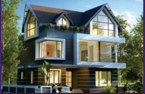
GREENDALE - KAKKANAD