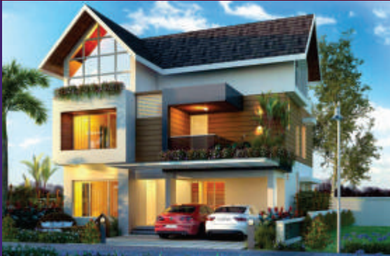
RIVERWOOD - EDAPPALLY