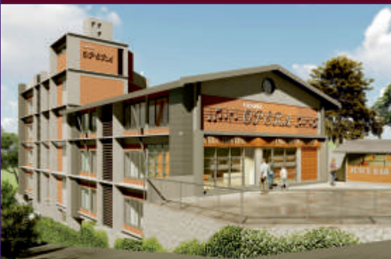
OPERA - KALAMASSERY