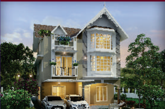
DANCING WOODS - ALUVA