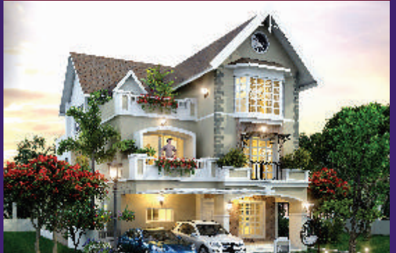
GARDENS OF DELIGHT - EDAPPALLY