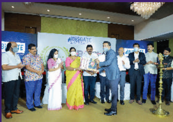
Innovative Builder Award from J. Chinchu Rani Honourable Minister of Kerala State