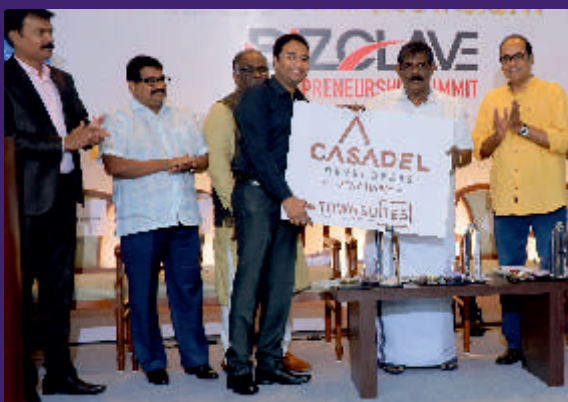
Launch of Casadel TownSuites by Shri Antony Raju - Transport minister of Kerala