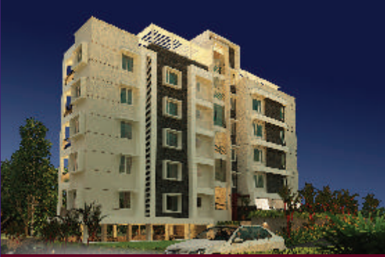
SKYSCAPE - INFOPARK, KAKKANAD