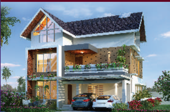
RAINDROPS - KAKKANAD