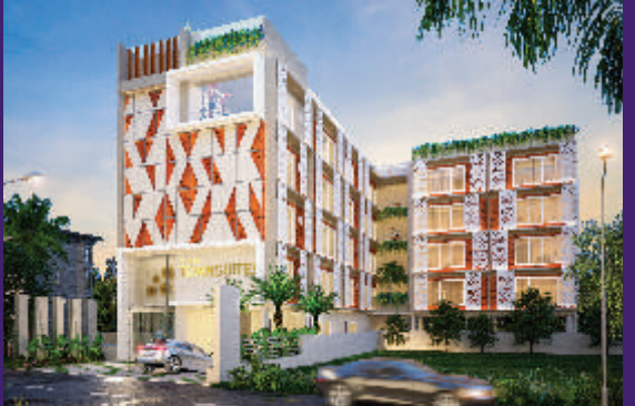
TOWNSUITES - KALAMASSERY