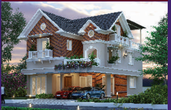
AFTER THE RAIN - KAKKANAD