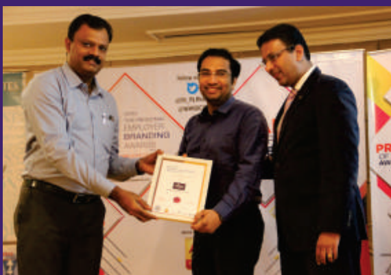
Brand Leadership Awards 13th Regional Employer Branding Awards