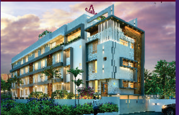
TOWNWALK - KALAMASSERY