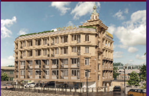
TOWNHILL - MUTTOM