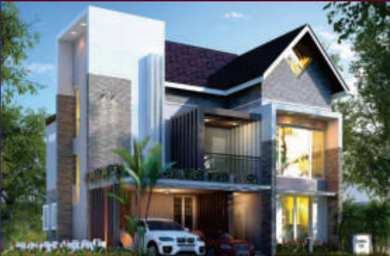
SKYLIFE - INFOPARK, KAKKANAD