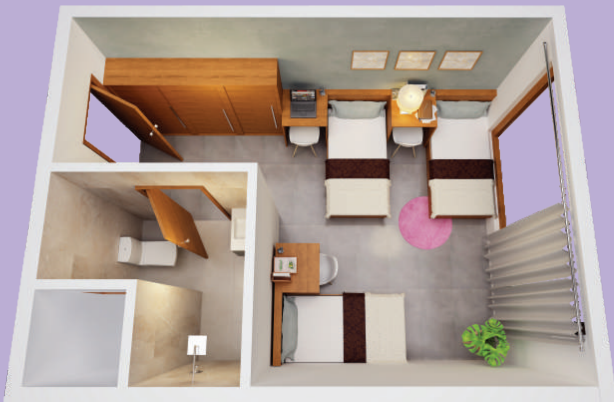
TYPE D (3 BED)