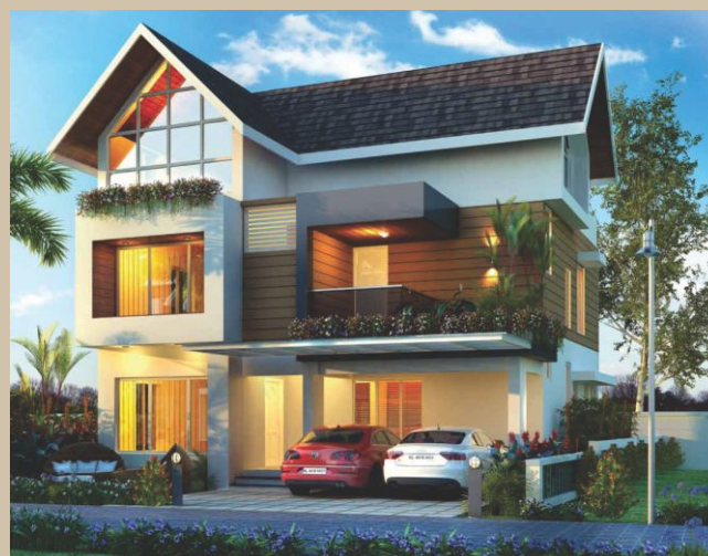
RIVERWOOD - EDAPPALLY