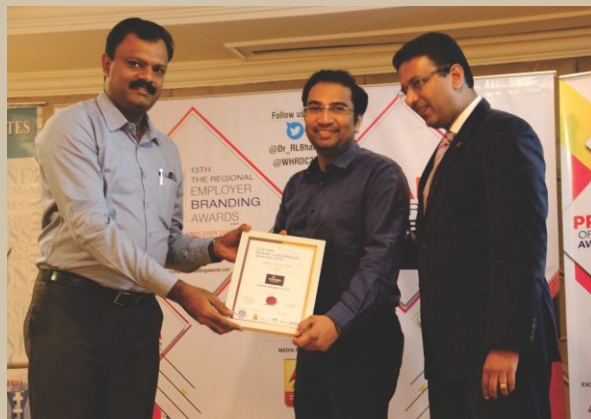
Brand Leadership Awards 13th Regional Employer Branding Awards