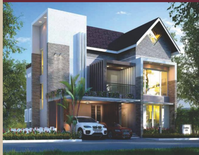
SKYLIFE - INFOPARK, KAKKANAD