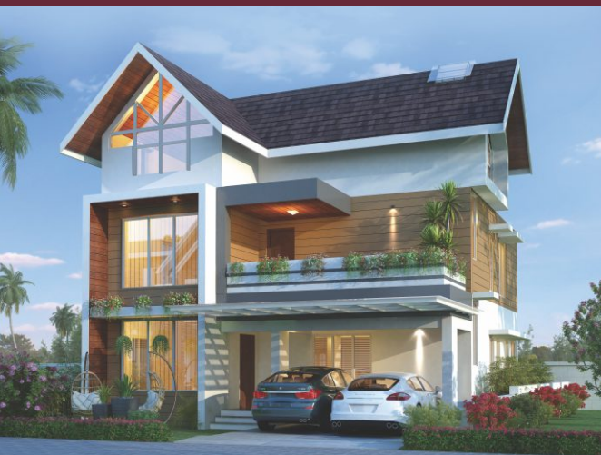
RAINDROPS - KAKKANAD