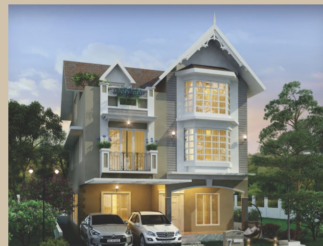
DANCING WOODS - ALUVA