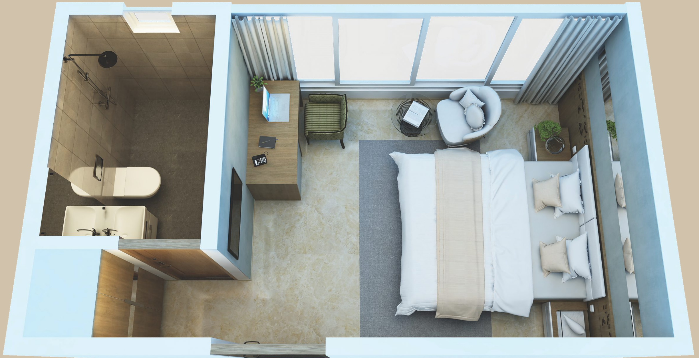
INTERIOR CONFIG OF A TYPICAL UNIT