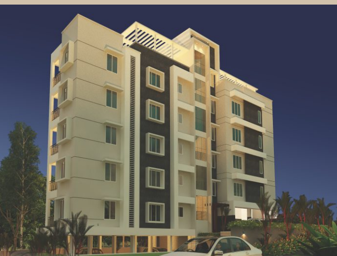
SKYSCAPE - INFOPARK, KAKKANAD