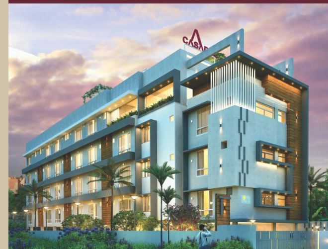
TOWNWALK - KALAMASSERY