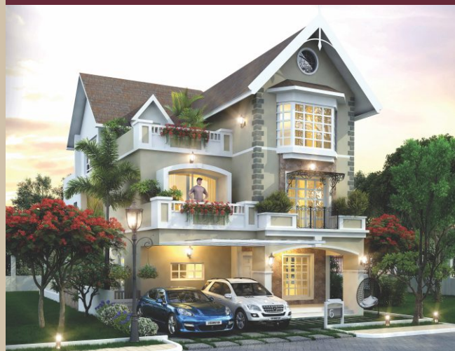
GARDENS OF DELIGHT - EDAPPALLY