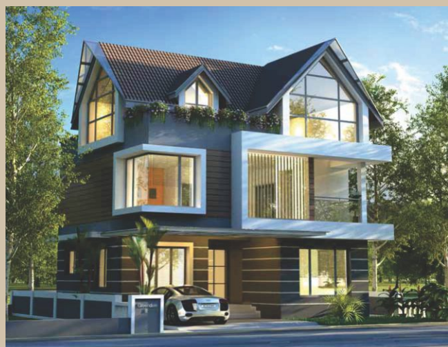
GREENDALE - KAKKANAD